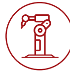
MACHINERY & EQUIPMENT